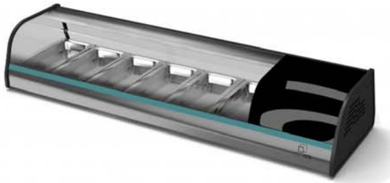
Refrigeration - Refrigeration Essenzial Line - Countertop displays - Tapas display cases